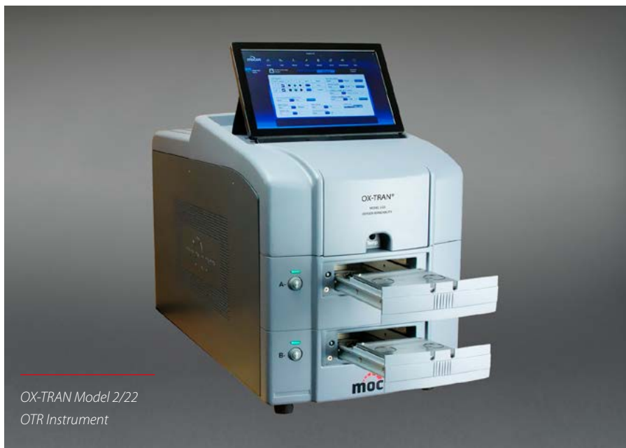
OX-TRAN Model 2/22 OTR Instrument